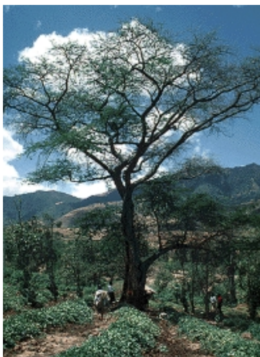
Crops of sweet potato grown under the canopy of F. albida at Gelemso in Ethiopia.

Ross, J.H., 1977. A Conspectus of the African Acacia Species. Memoirs of the Botanical Survey of South Africa No. 44.