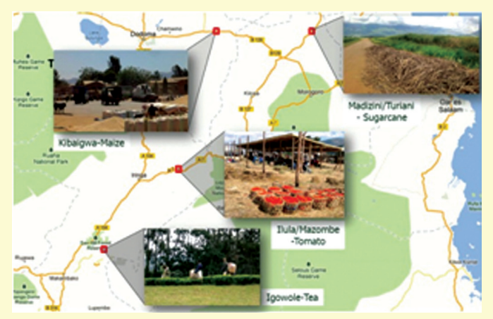
Map of study sites

The empirical data on which this policy brief is based was collected between 2011 and 2013 in the four EUCs, Igowole, Ilula, Kibaigwa and Madizini in Tanzania.